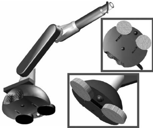
Fig. 2. Collie robot assembly and details.